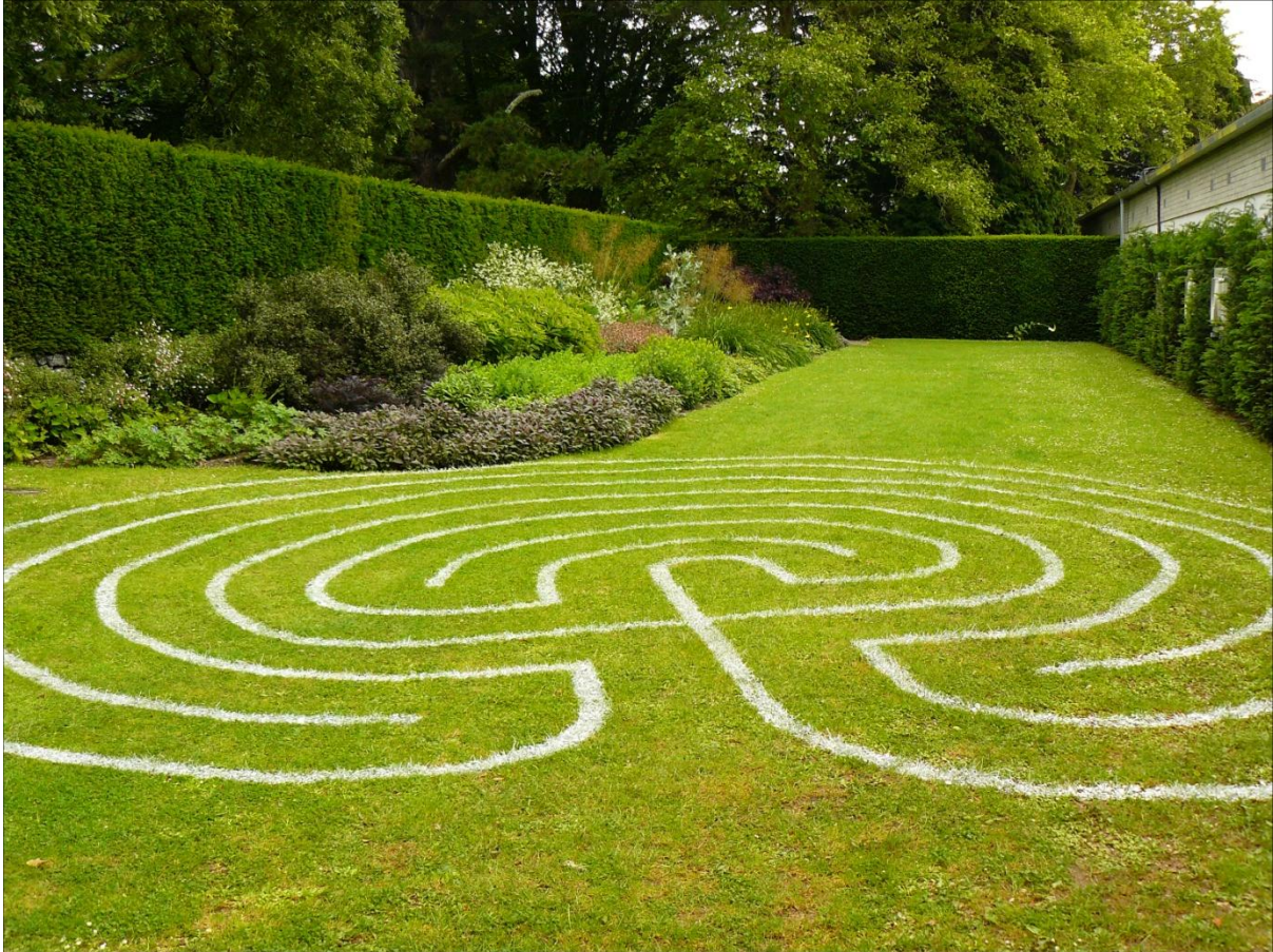
The labyrinth at Dartington.

I have a keen interest in labyrinths, though would not consider myself an enthusiast – tending to make one only once a year or so when the mood takes me, usually in public, always to mark a special occasion related to the earth.