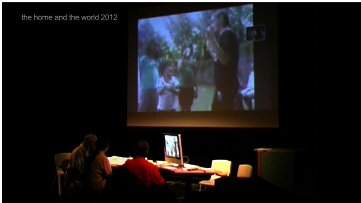
Video still

We moved indoors to watch the Delaware walk on our big screen.